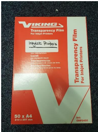
Packs of transparency film