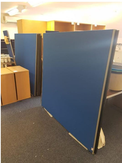
4 full height office screens