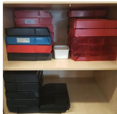
Plastic desk trays