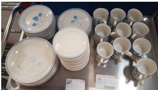
20 cups and saucers 20 small plates 6 large plates