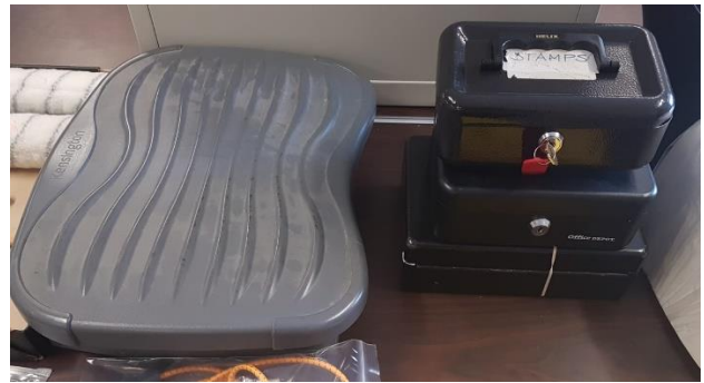
3 cash boxes