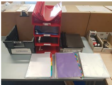
Clipboards, plastic wallets, stamps and ink, clips, A4 divider and index cards