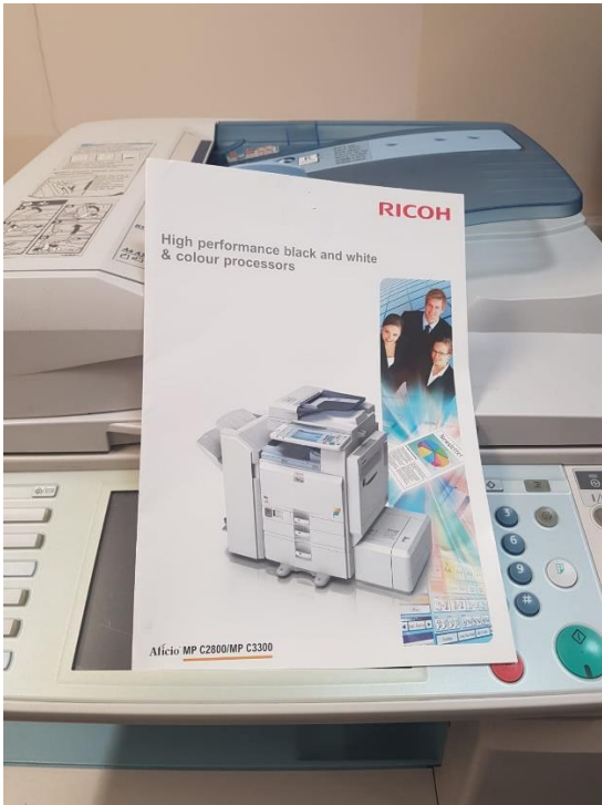
Photocopier RICOH Aficio MP C2800