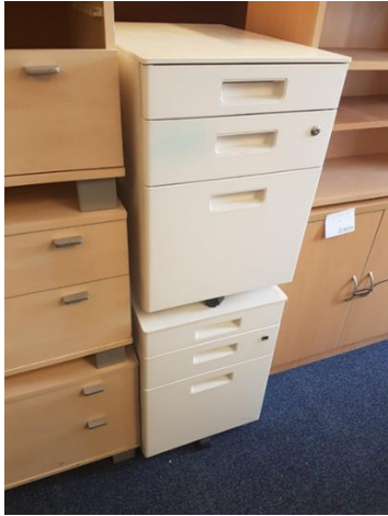
2 metal drawer units